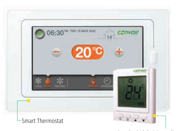
Standard Digital Controller

The standard digital controller is used for heating only and comes with a large display screen that is easy to read.