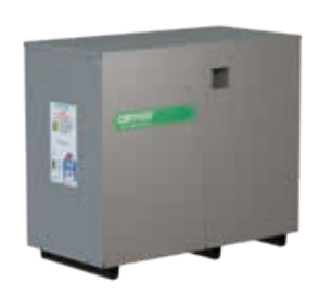
C3, 4, 5 series

C6 Series: The C6 range of heaters are the most efficient heaters in the Convair range, ensuring ultimate comfort and maximum efficiency.